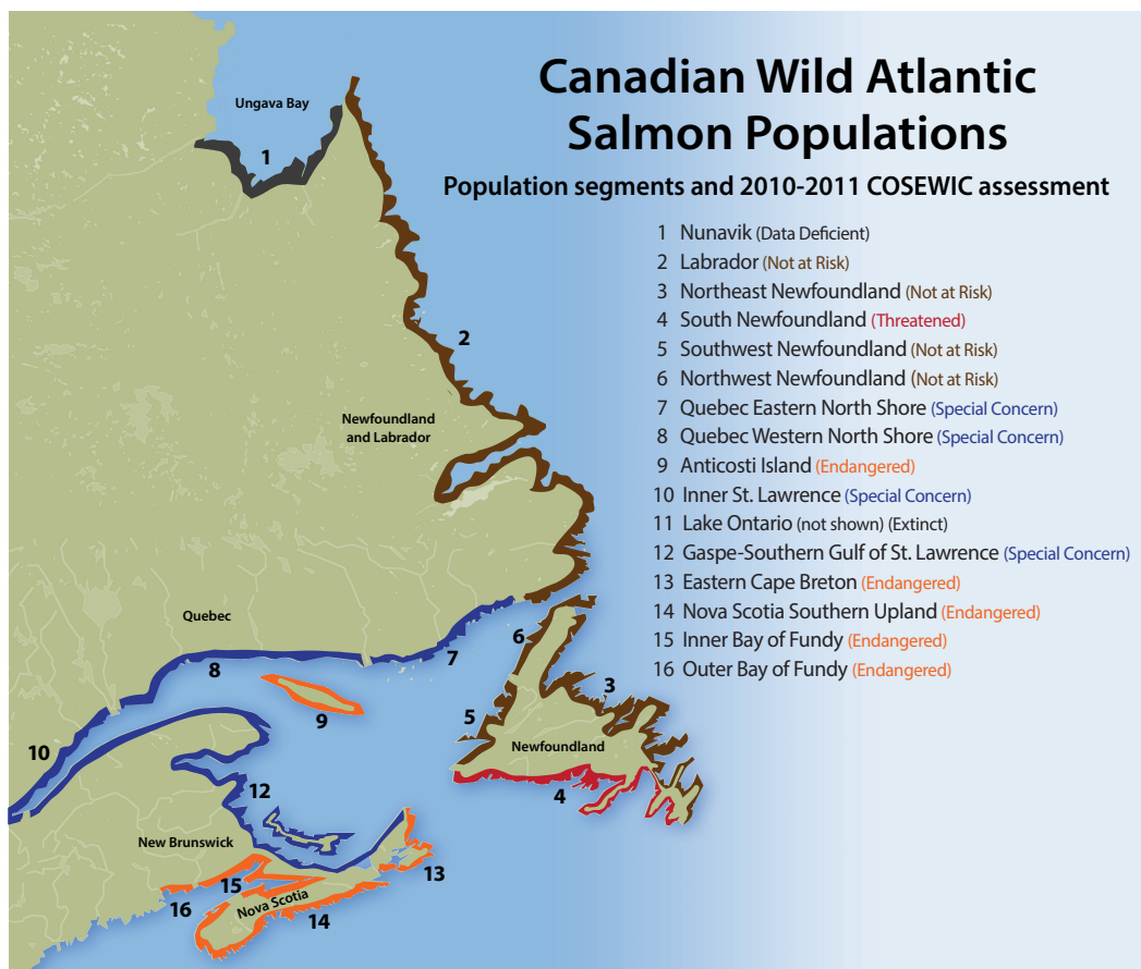
Figure 3: Map of designatable units and COSEWIC's 2010-2011 population assessment.

COSEWIC found 10 of the sixteen designatable units were at risk of extinction: four Special Concern, one Threatened, and five Endangered, including the previously assessed Inner Bay of Fundy population.